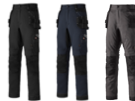
Black Navy/Black Grey/Black