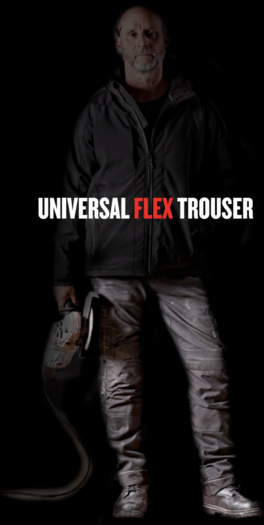
UNIVERSAL FLEX TROUSER