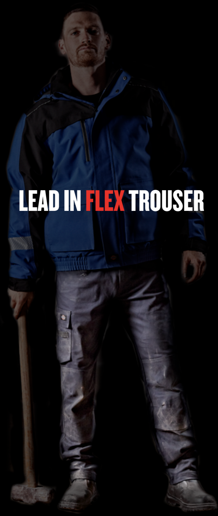
LEAD IN FLEX TROUSER