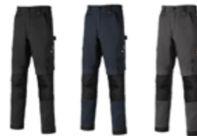
Black Navy/Black Grey/Black