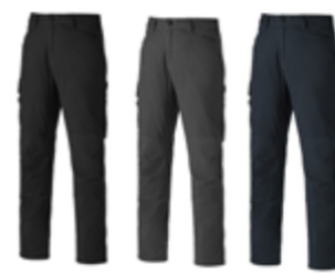
Black Grey Navy