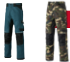
Teal/Black / Camo