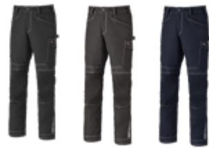
Black Grey Navy