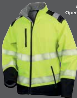
FLUORESCENT YELLOW/BLACK (394/BLK)