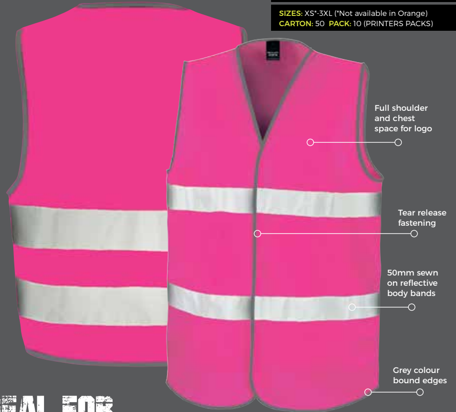
FLUORESCENT PINK (806)

SIZES: XS-3XL (*Not available in Orange) CARTON: 50 PACK: 10 (PRINTERS PACKS)