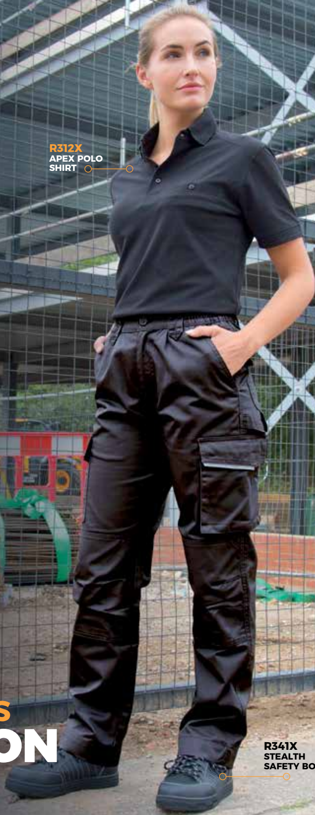
R341X STEALTH SAFETY BOOT