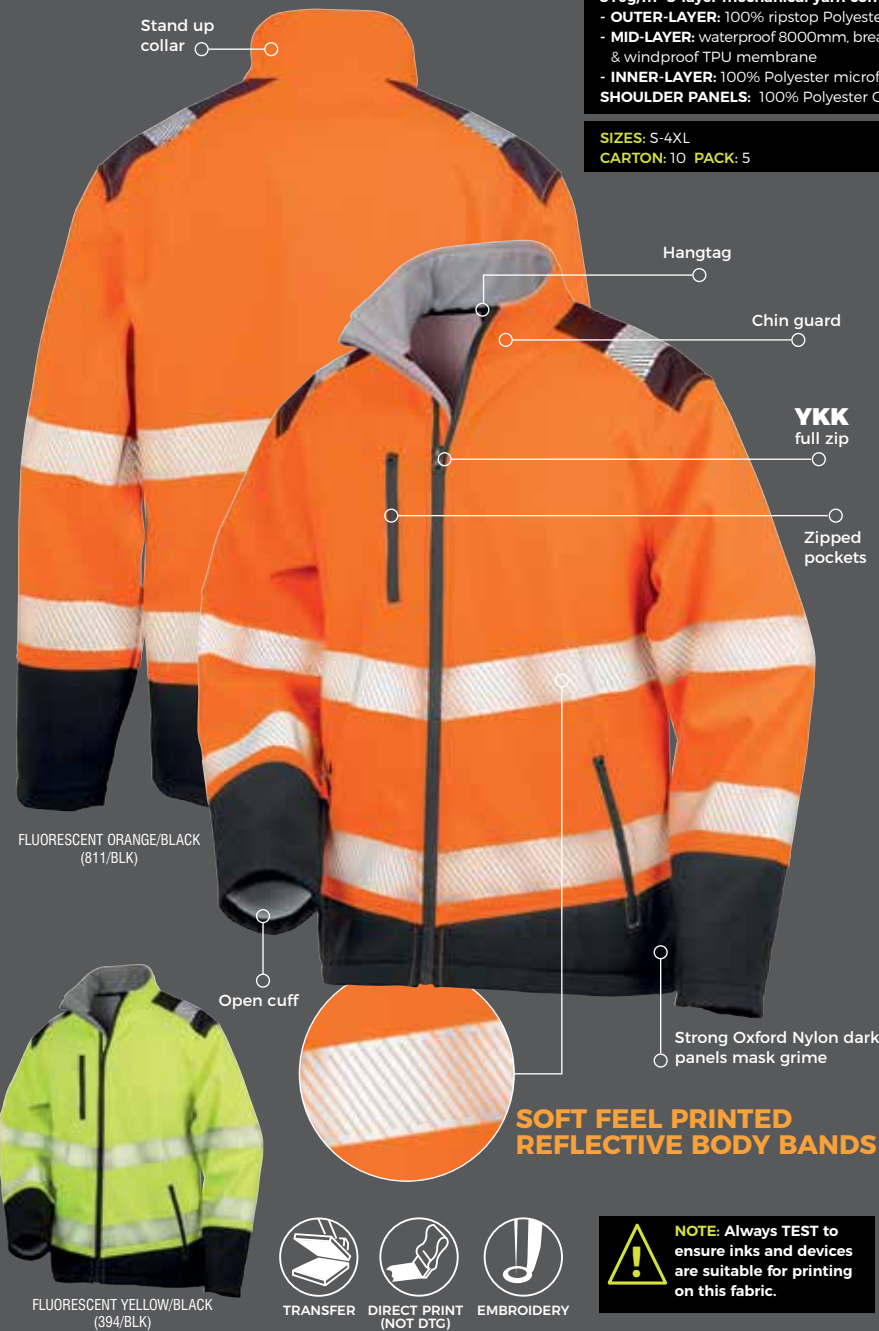
FLUORESCENT ORANGE/BLACK (811/BLK)