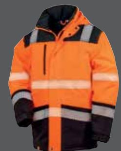
FLUORESCENT ORANGE/BLACK (811/BLK)

FLUORESCENT YELLOW/BLACK (394/BLK) SOFT FEEL PRINTED REFLECTIVE BODY BANDS