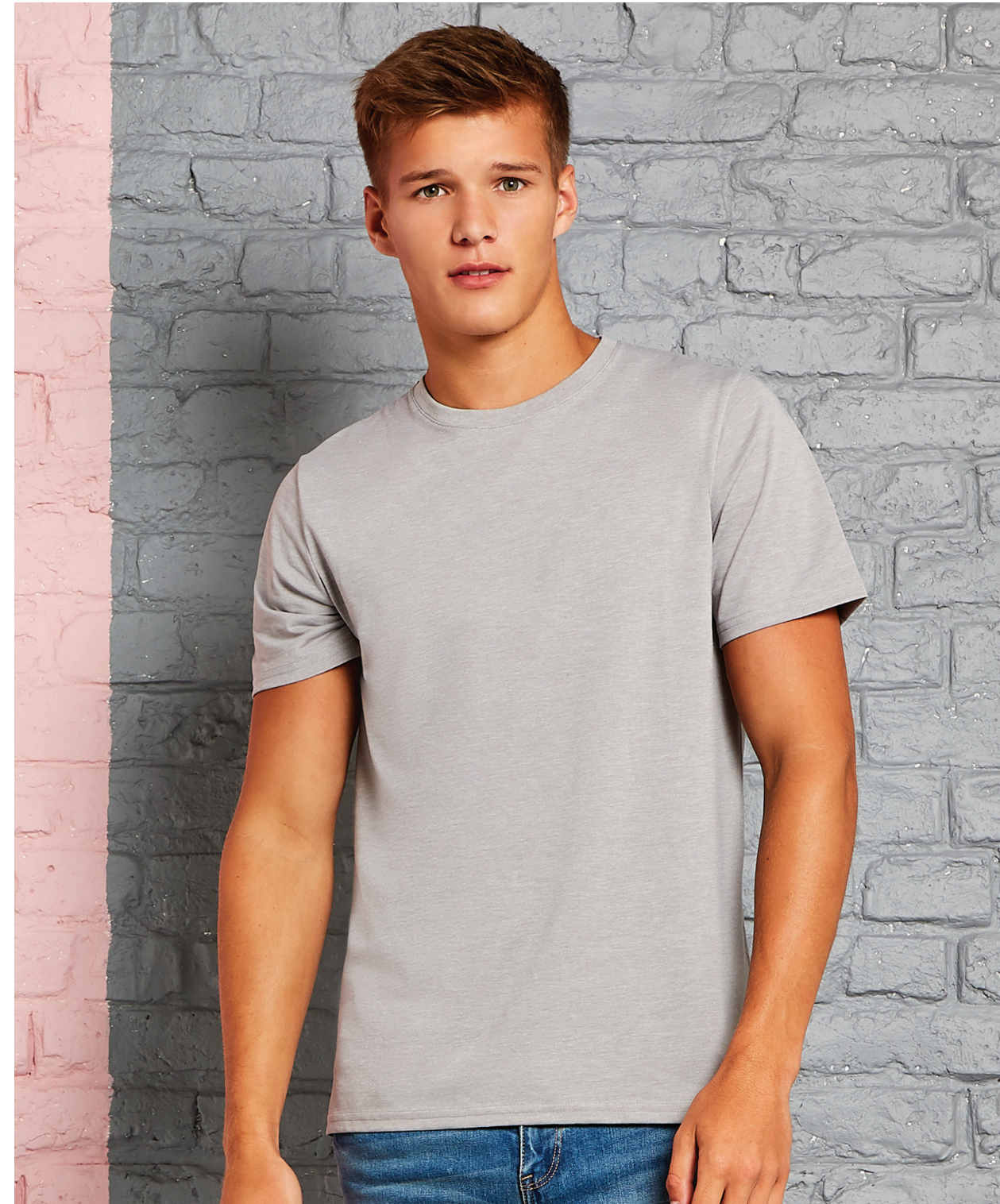
VAN102 MEN'S VAN502 WOMEN'S

SIZES VAN102 XS - 2XL VAN502 8 - 16. FABRIC 65% polyester 35% cotton. WEIGHT 160gsm. FEATURES Removable label. Slim fit. Crew neck. Self fabric back neck and shoulder tape. Side seams for enhanced fit.